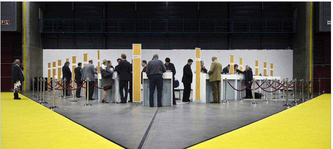
Shareholders cast their vote.

We discuss voting issues with our investee companies, who often seek to engage stakeholders to share agenda and meeting materials, and we also respond to companies' requests for information about our voting