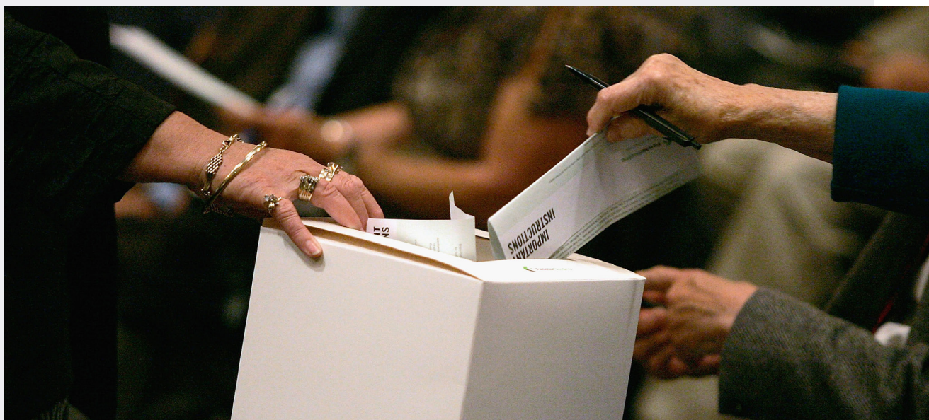
Shareholders place their votes into a ballot box.

We maintain close relationships with a range of shareholders as well as other agents of corporate change. Where legally permitted, we are willing to consider collaborative engagement initiatives which may involve filing shareholder meeting resolutions.