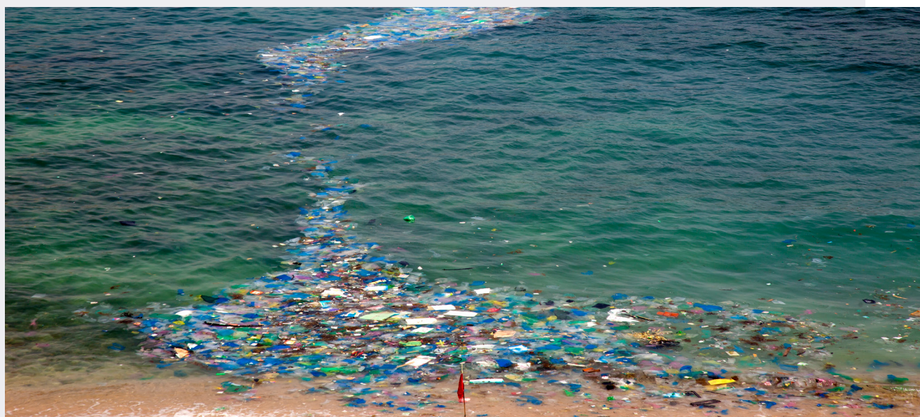
Plastic waste washing up on a beach.