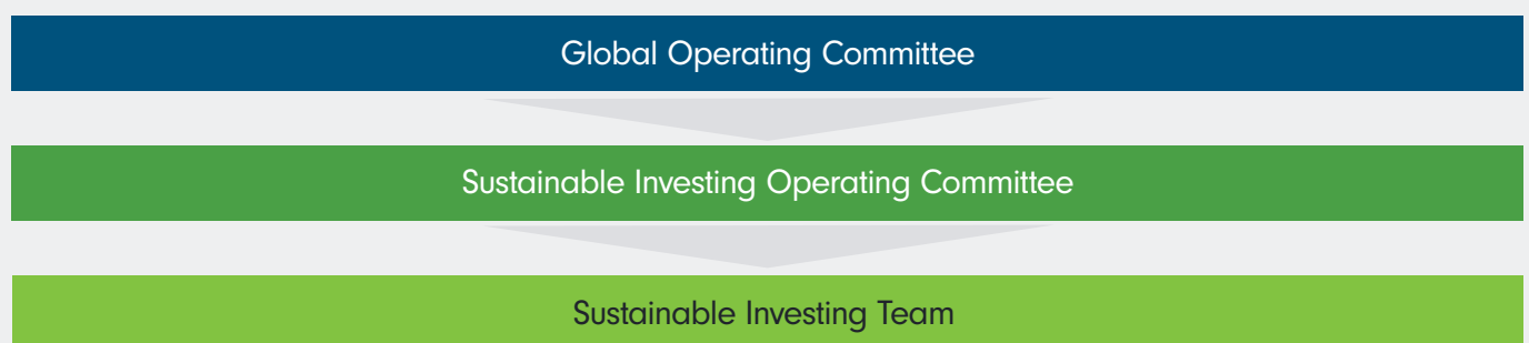
Chart 1: The Sustainable Investing Operating Committee

We seek to exercise all voting rights in accordance with all applicable laws and regulations, as well as being consistent with the respective investment objectives of the various portfolios. Where Fidelity sub-delegates investment management responsibility for certain assets to third parties, this policy will not apply to those assets and,