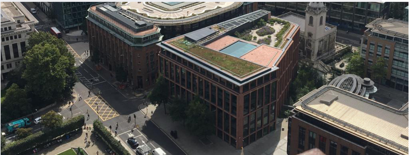
Cannon Street office, Fidelity International.

When contacting us, please note that FIL Limited (Fidelity International), our organisation, and its subsidiaries and affiliates, are independent, distinct and separate companies from Fidelity Investments / Fidelity Management and Research Company (FMR) and Fidelity Institutional Asset Management (FIAM), which together are referred to as Fidelity Asset Management (FAM), as well as other organisations with similar names. Strict information barriers are in place to ensure that sensitive investment and voting data is not shared between the investment professionals of FIL Limited and FAM.