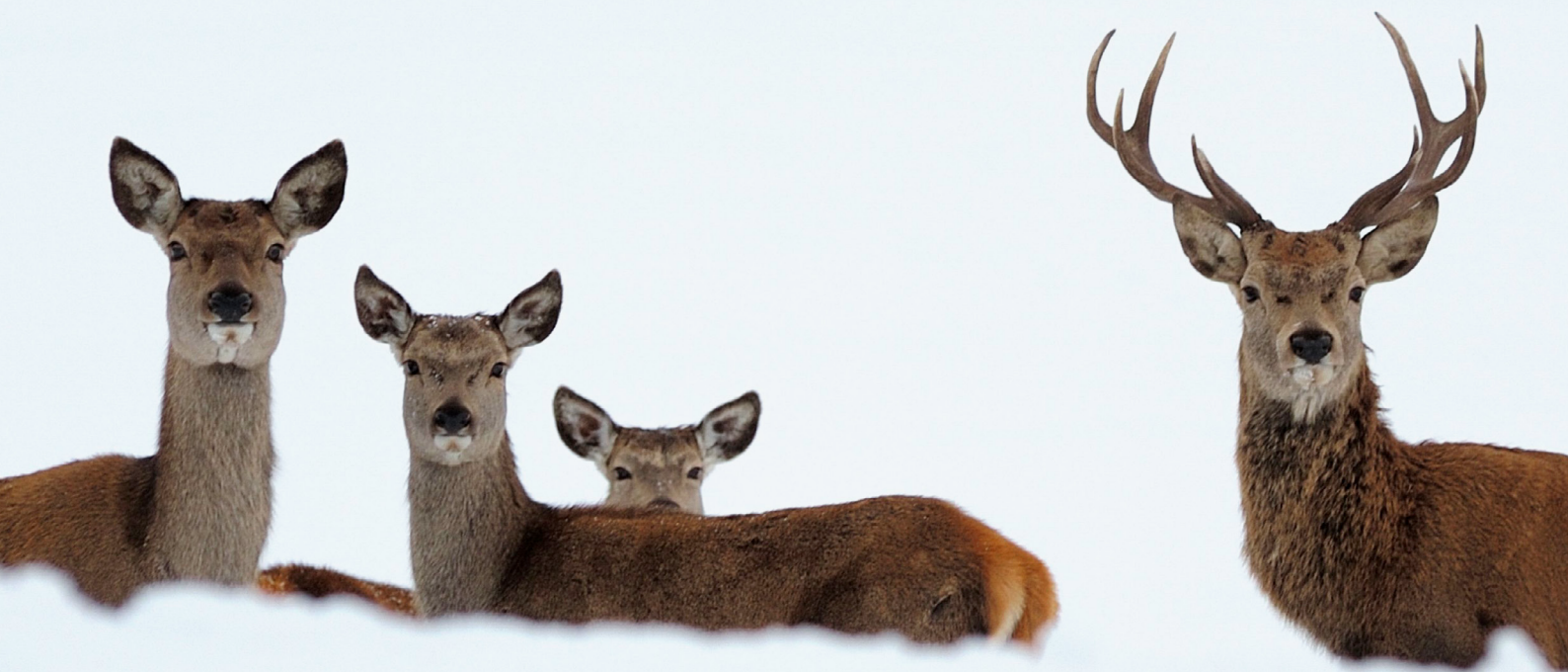
A herd of deer gathers.